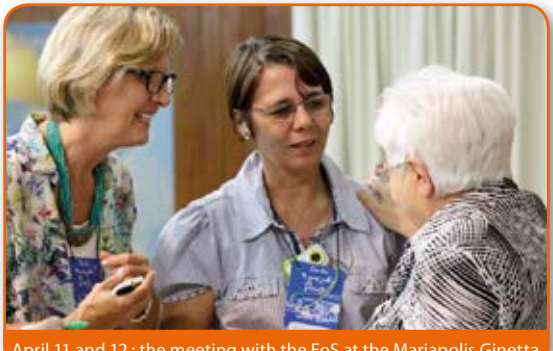
April 11 and 12: the meeting with the EoS at the Mariapolis Ginetta