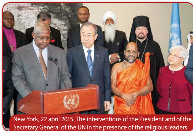
New York, 22 april 2015. The interventions of the President and of the Secretary General of the UN in the presence of the religious leaders