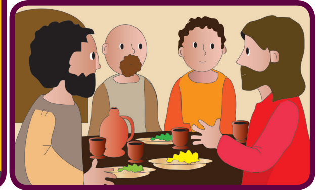
So to help them, Jesus told them, "Peace I leave you, my peace I give you" (Jn 14:27).