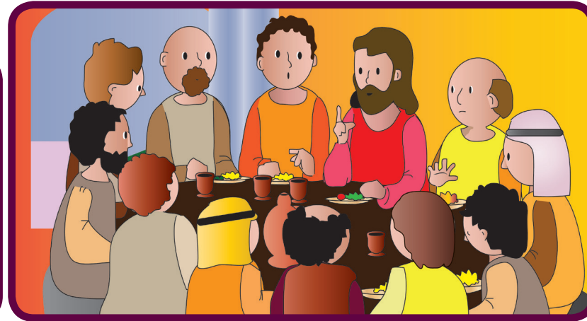
He told them that he would be leaving them soon to go back to his Father in heaven. But his disciples were very sad because they didn't want him to go.