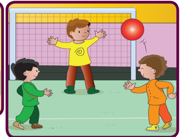
He understood and stopped doing it. Now the three of them are best friends.