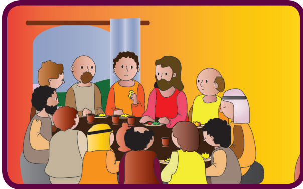
Jesus was eating his last meal with his disciples.