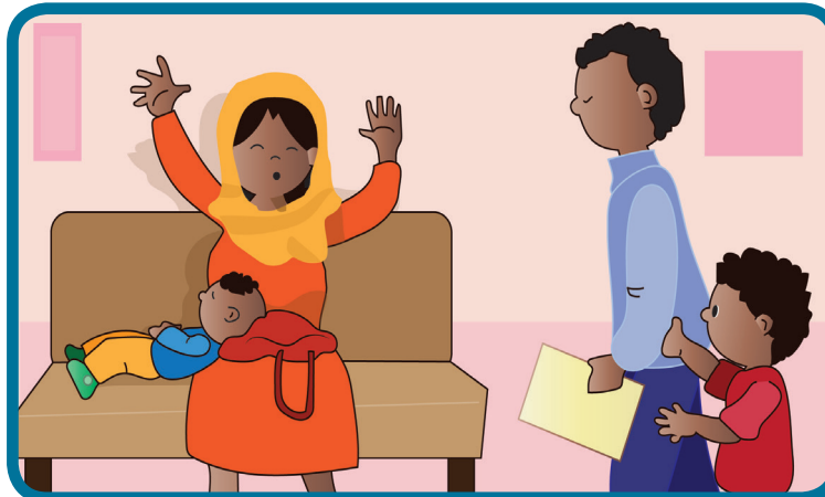
When we came out of his office, we met a Muslim woman who was crying loudly because her little boy was very sick and no one in the hospital wanted to take care of her because of the conflict between Muslims and Christians. My dad passed right by her, too, without doing anything. I insisted that we had to help her, but he said he was there only to take care of me.