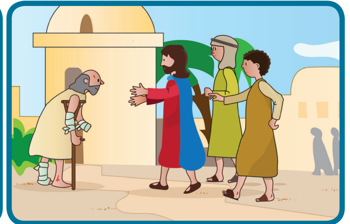
Jesus asks us to love everyone and in this way, we will build a world of justice and peace.