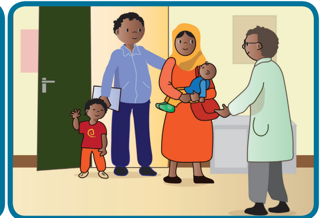
So I told him, "Daddy, when you get to heaven, Jesus will tell you, 'You did that to me!'" Then my Dad agreed to help her and we went to his friend with the child and his mom. After the doctor took care of the child, we said goodbye to one another and I was very happy.