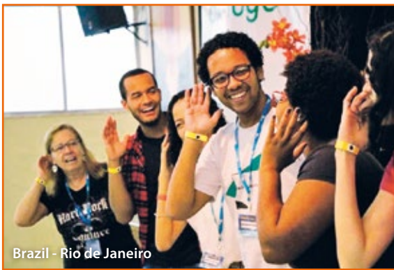
Brazil - Rio de Janeiro

topic of the «borders to overcome» (Beyond all borders). A young 18 year old girl from Serbia said: «When we met with the youth to prepare the Mariapolis, we wanted to focus on the reason why we have the Mariapolis every year. I said that for me it was not a matter of attending the Mariapolis every year: the Mariapolis is my way of life which I must share with others».