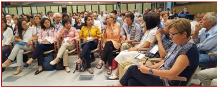
14 september. The meeting with the zones of the Americas

“It is a fascinating vision”, commented a nun summarizing the feelings of many after these first two days. To look at the Church from above, from the “One”, from the perspective of God, is most probably the first thing to be done in this most delicate moment of its journey.