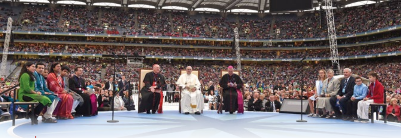
Dublin, 25 august. The celebration in Croke Park, with two families who shared their experience, from India on the left and from Canada on the right.