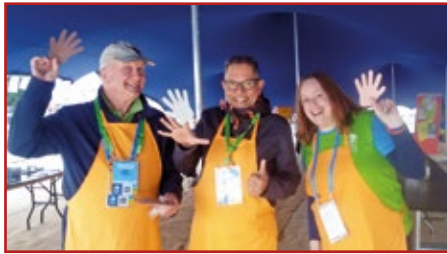
The services given by the people of the Focolare Movement were varied.

«Croke Park that Saturday evening was sensational! an Irish couple commented. Pope Francis arrived as they were singing that there is a crack in everything, but it is there that the light can enter. We remembered Jesus Forsaken present in this “dark night” of the family and of the Church, but the Holy Spirit always finds a way to let the Light enter». «Pope Francis with his beautiful smile, so full of love and compassion – added a father – brought us all to God. His words were just right and could be understood by everyone! I liked it when he said: “no one says that family life is easy. It is like preparing tea: it is easy to boil water, but a good cup of tea requires time and patience to steep! And it is in this way that everyday Jesus warms us with his love and penetrates our entire being...».