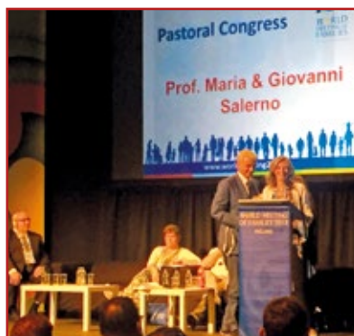
The intervention during the Congress of the Salerno couple, in-charge of New Families.

concentrated on the scandals, surprisingly spoke of the more than 400.000 people who came to see the Pope in person, thousands of whom had to travel in the middle of the night