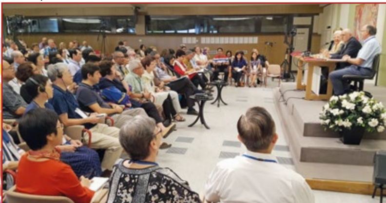
15 september. The meeting with the zones of Asia and Oceania