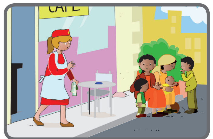
in front of my coffee shop, I saw a large group of for free. In another room where people used to immigrant mothers with their children, who were play cards, I set up a table to change the little crying because they were hungry.