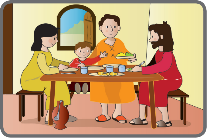
I will eat with you and you with me.