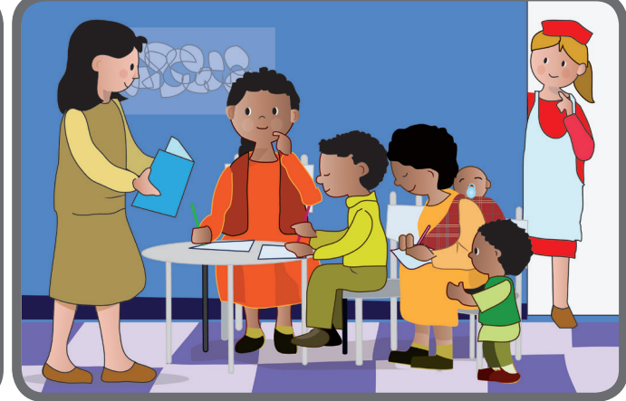
Later on, we used that room to teach them our language. They call me their "African Mamma" and now other people and organizations are supporting me in helping them.