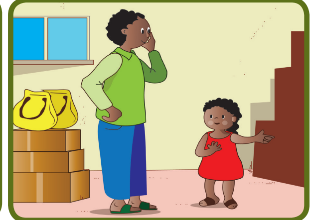
She went to her Dad and told him, "I want to give a pair of shoes, too!"