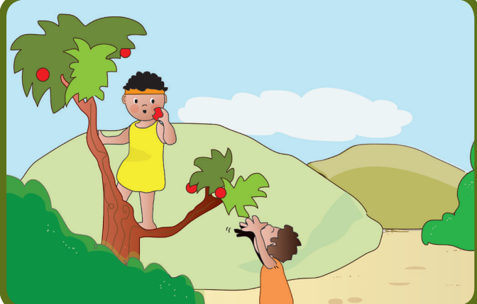
The secret of true joy is to have Jesus in our heart. With him we can overcome any difficulty.