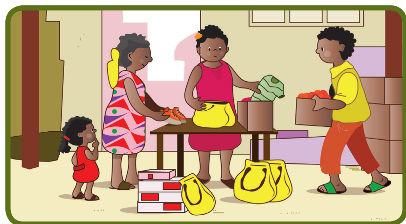
When we give, we are happy: To help the refugees coming into our country, the community of Abuja collected clothes, medicine, food and money. One Gen 4 was there when they filled the bags and saw that someone had given shoes for little children.