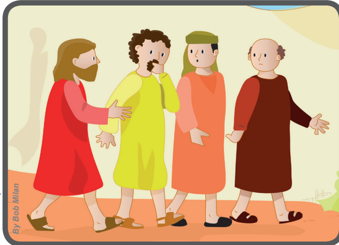
Jesus was talking to his disciples and told them that one day he would come back.

“Keep awake therefore, for you do not know on what day your Lord is coming” (Mt 24:42).