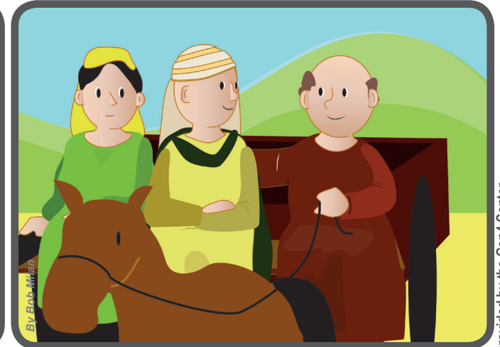
...don't wait until tomorrow to forgive that person. Forgive them right away.