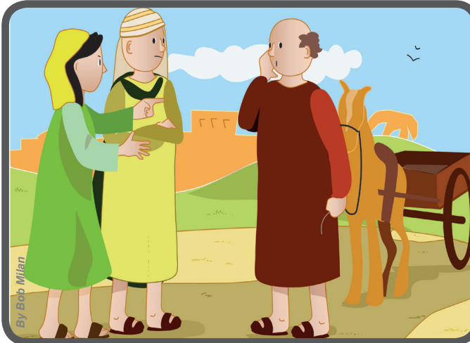
He asked them to be attentive and not miss any opportunities, like for example, if someone hurts you...