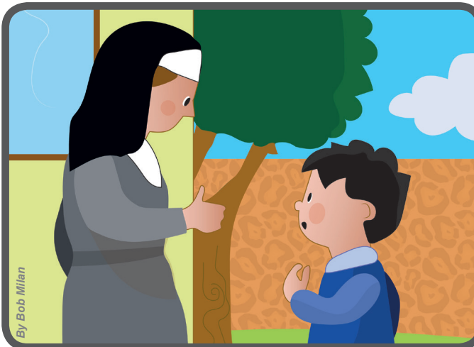
I went to my teacher, who is a Sister, and instead of reporting what they did, I told her how much it hurt me.