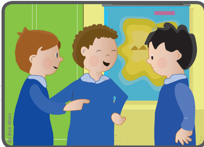
One day at kindergarten, the other children were making fun of me because I am fat. I felt very bad and started to cry.