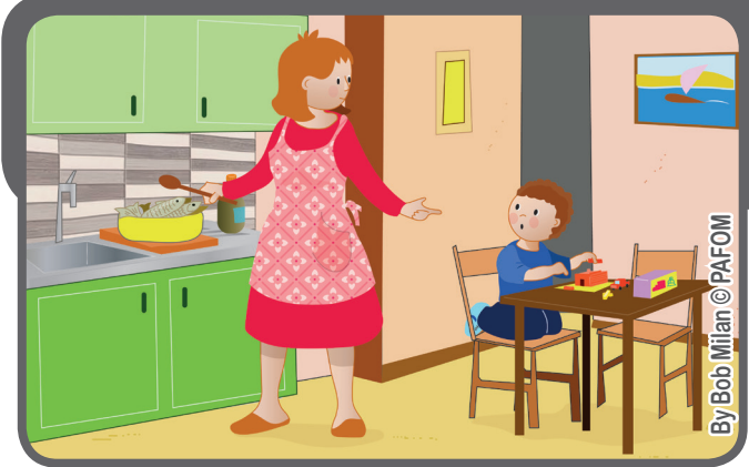
One night my mom was very tired and she asked me to help her prepare the dinner. I didn't want to.