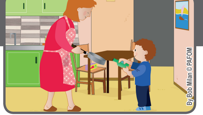
But then I remembered the Cube of Love. That morning when I rolled it, it came up "Make yourself one with others." So I decided to help her.