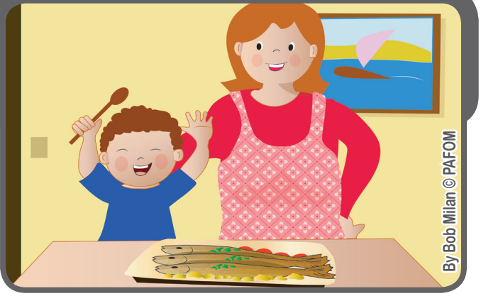
We prepared trout cooked in whiskey because we didn't have any cooking wine in the house. We really had a good time together.