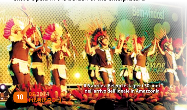
Il 6 aprile a Belem festa per i 50 anni dell'arrivo dell'Ideale in Amazonia

An invitation to communion. Then the meeting at the Mariapolis Ginetta with the communities and social organizations of the Movement that were born in Brazil and in other parts of Latin America, which were given full recognition