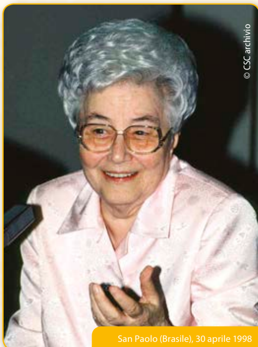
San Paolo (Brasile), 30 aprile 1998

Now, since the beginning of the Movement, as we know, the search for