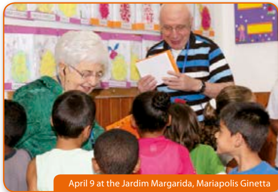
April 9 at the Jardim Margarida, Mariapolis Ginetta