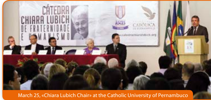
March 25, «Chiara Lubich Chair» at the Catholic University of Pernambuco