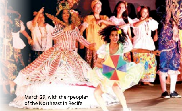
March 29, with the «people» of the Northeast in Recife

This was seen in the meeting with the Bishops who share the spirituality of unity: so many experiences of communion lived by them within the ecclesial bodies, in their dioceses! Then those involved in the field of politics, who are making fraternity the fundamental law of their commitment so that what they do will be an authentic service for the common good, also left with renewed energy.