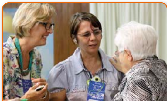
April 11 and 12: the meeting with the EoS at the Mariapolis Ginetta