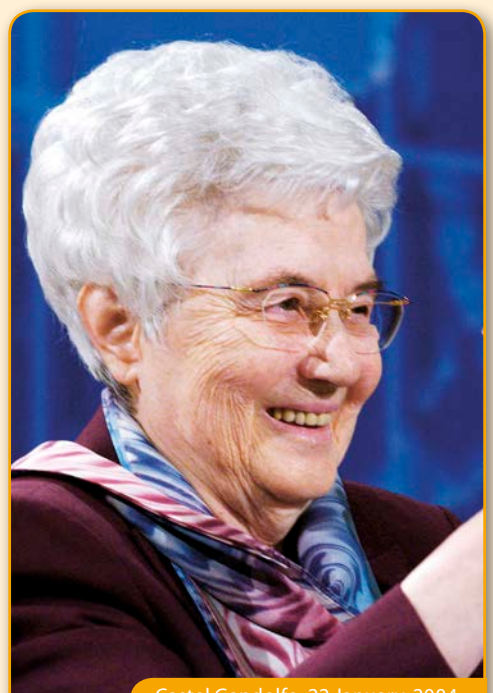
Castel Gandolfo, 22 January, 2004. Chiara at the Collegamento CH

The Pope calls us all "apostles of dialogue". "In harmony with the Magisterium of the Church, the men and women focolarini have become apostles of dialogue..." he writes. It is a new title we never had before, even though the content of all our actions lies there, in dialogue.