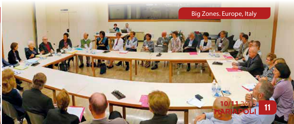
Big Zones. Europe, Italy