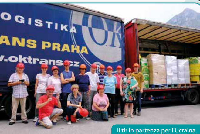
Il tir in partenza per l'Ucraina