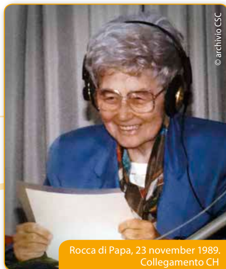
Rocca di Papa, 23 november 1989. Collegamento CH

Our statutes put unity as the basis of everything, as the norm of norms, as the rule to live before every other rule. It is the word for us, it is the rock. We do not have meaning in life if not in this word, where everything acquires a meaning: every action of ours, every