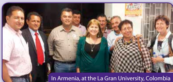
In Armenia, at the La Gran University, Colombia

In Antioquia she held a meeting with a group of public officials, almost all of them