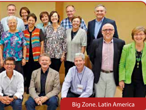
Big Zone. Latin America