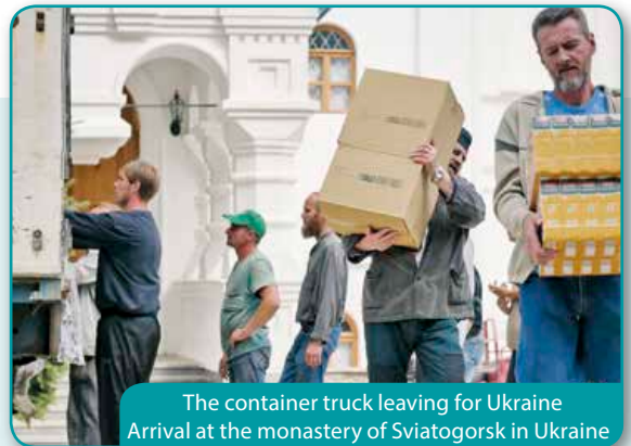
The container truck leaving for Ukraine Arrival at the monastery of Sviatogorsk in Ukraine

Aside from the refugees who land everyday in Europe, there are thousands who seek asylum in other Countries of the world, also in South America: every week, for example, around 20 Syrians request for visas to enter Brazil . To these are added refugees from the African continent (around 4,500) and, finally the Haitians who are the largest group. These, even though they are not officially considered as refugees, because they don't fall into the international category to be considered as such, have been granted this status by the