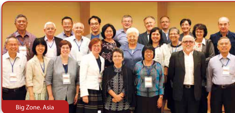
Big Zone. Asia

careful in this regard. Also for the councils of the Zonetta I would like to say: certainly, we need a group that will help the persons responsible, a group that sees, that applies, without a doubt. But if we say: "This is the Council of the Zonetta, this is the one in-charge of..." then that's the end of it, that's the end of it! We must enter into the mindset that these are people who assist, and therefore today they can be these people and tomorrow others, according to the actions that are being undertaken in that moment. These are all the things that in this moment we must have the courage to reduce».