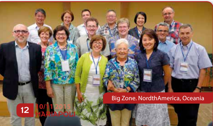
Big Zone. NordthAmerica, Oceania

The Summer school, which is becoming more widespread have revealed themselves to be important occasions for the formation of the new generations. This is what Jesús said: «The Summer school must achieve this; to make the life be reflected in the way of thinking, to allow for categories to be acquired so that one cannot but act in a certain way, because one lives in this way and thinks in this way. This is humanism that is perfectly workable, because it has nothing confessional about it, but rather it addresses the most radical part in man. It is a formidable anthropology. This