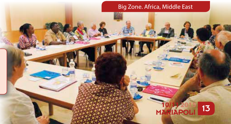
Big Zone. Africa, Middle East

On Mariapoli online www.focolare.org/notiziariomariapoli you will find the Special Report on the "Daily happenings of the Meeting of the Delegates"