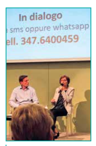
A G and R P, delegates of the Focolare Movement for Italy

words: «Problema (Problem)»: what are the emerging problems in our territories? «Pensiero (Idea)»: what are the ideas or thoughts that we can offer through Città Nuova? «Parole (Words)» and «Persone (People)»: which writings or authors can help us to face that specific problem? «Progetti (Projects)» and «Partner»: what projects can be started and with whom