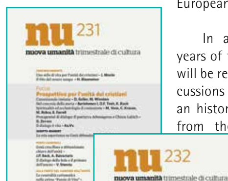
The draft of the two covers of the next issues of Nuova Umanità

The coming issue will focus on the present-day frontiers of ecumenism, with articles written by experts in this field. On the same wavelength l'ecumenismo, the last issue of 2018 will be dedicated to Islam - Christian dialogue with contributions by muslims and catholics. In the 2019 programme there is an exceptional offer: for the occasion of the European elections the review with dedicate an entire number to the vision of Euoprea