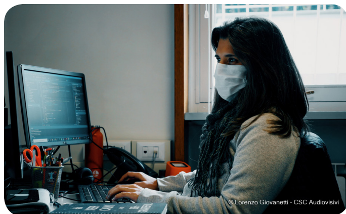
Lorenzo Giovanetti © CSC Audiovisivi