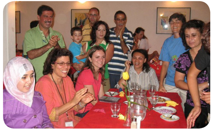
Holy Land: event between Christians and Muslims