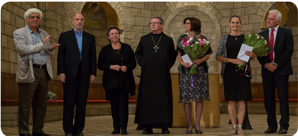
Mount Zion Award October 2013