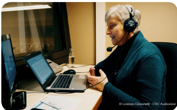
Lorenzo Giovanetti © CSC Audiovisivi