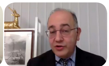
Luigino Bruni