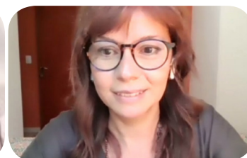
Paula Luengo © CSC Audiovisivi