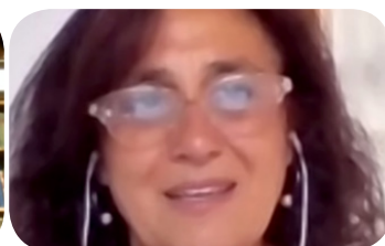
Silvina Chemen © CSC Audiovisivi