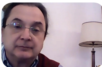
Claudio Guerrieri © CSC Audiovisivi