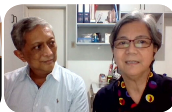
Vicky e Vic