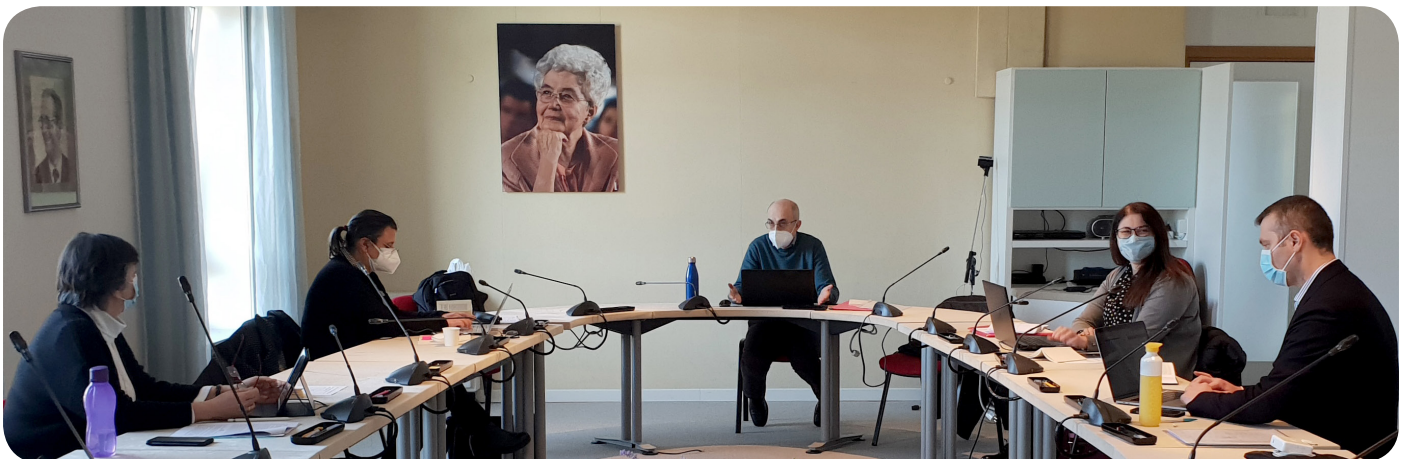
Electoral commission

Focolare Communications Office January 31, 2021