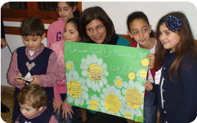
With Gen 4 in the city of Haifa