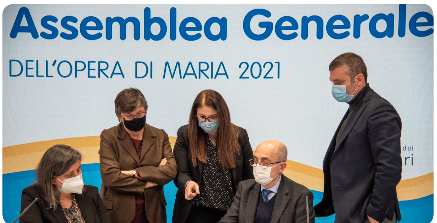
The Electoral Commission at work

Focolare Communications Office February 3, 2021