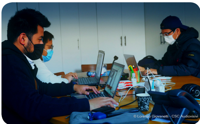
Lorenzo Giovanetti © CSC Audiovisivi

Focolare Communications Office January 30, 2021