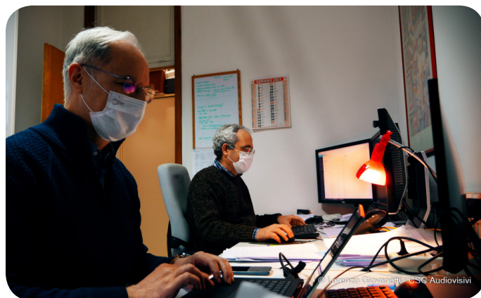
Lorenzo Giovanetti © CSC Audiovisivi