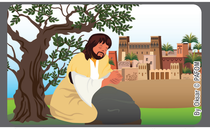
Jesus also taught us how to pray, telling us that God is a kind Father who loves everyone.