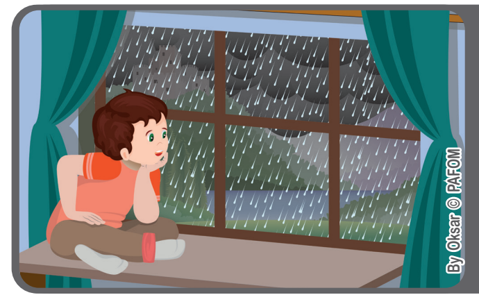
One day I was looking out the window and saw that it was raining a lot and there were lots of gray clouds.