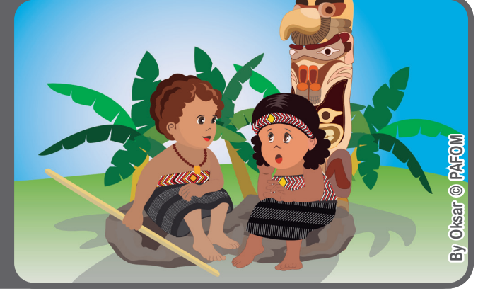
When we love people around us, it helps us to experience God's presence in our hearts and we feel like talking to him. God never leaves us alone.