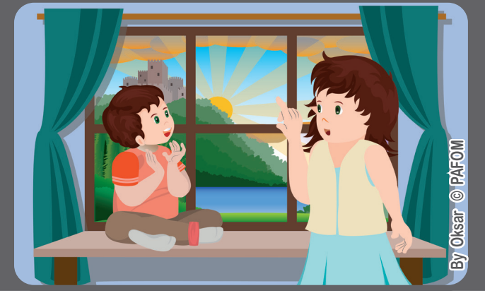
After a few moments I called my mother and told her, "Look at the sun peeking out from behind the clouds! It's really such a nice gift that Jesus is giving me!"