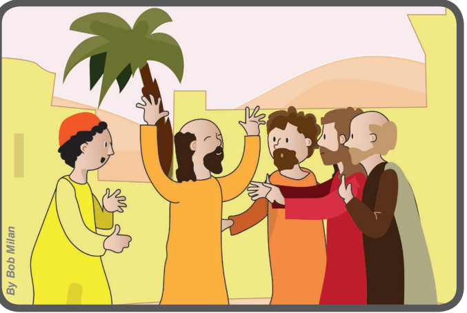
Jesus healed him and the people said, "We've never seen anything like this!" (Mt 9:32-33).