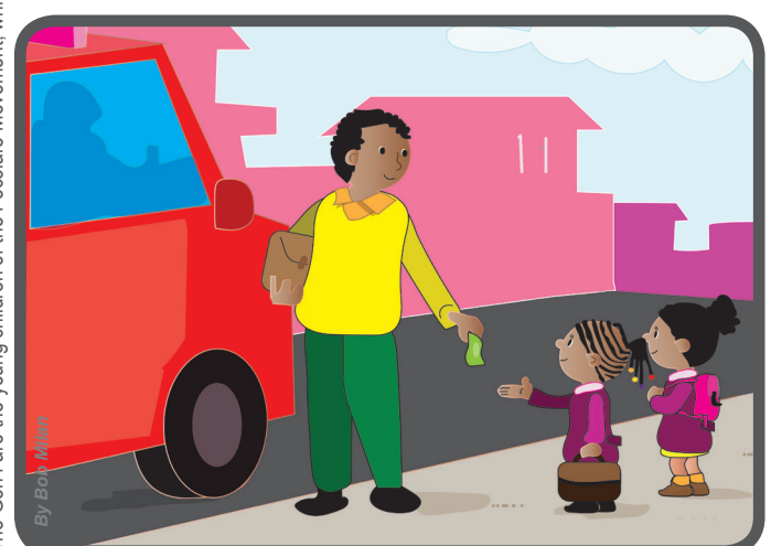
On the way to school, I was really very hungry. Then I met my uncle who gave me money to buy a sandwich.