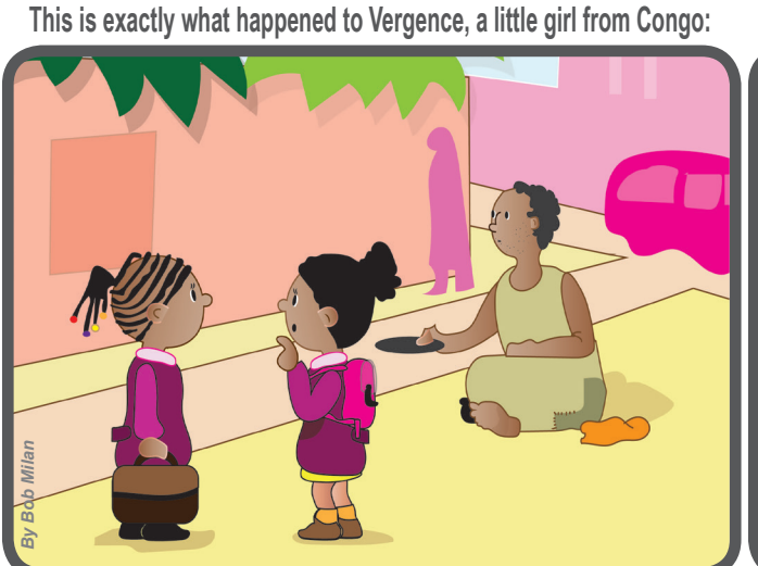
A little further along the road, I saw a poor man. I thought of giving him the money, but my friend who was with me said that I shouldn't. She said I should think of myself!