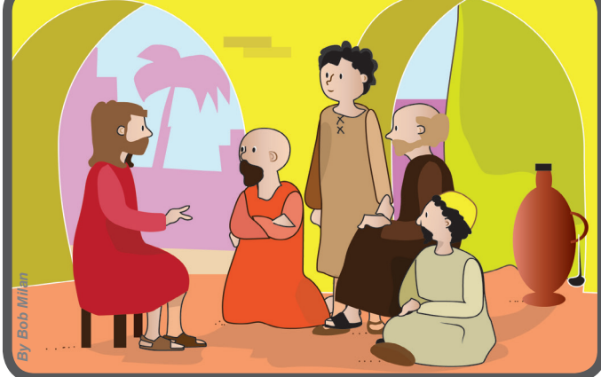
Then Jesus called his disciples aside and gave them the power to cure illnesses. He told them, "You received without payment; give without payment" (Mt 10:8).