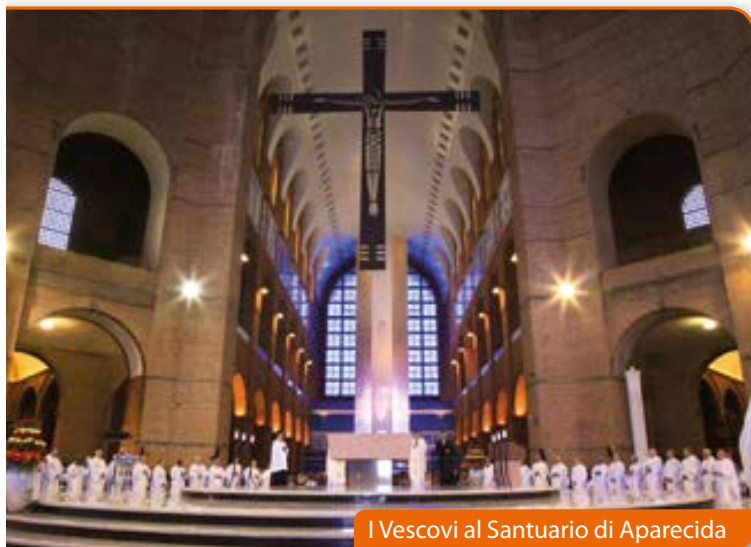
I Vescovi al Santuario di Aparecida