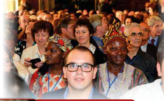
26 september. The Assembly is received in an audience by Pope Francis

This style was inaugurated already during the preparation, which then proved to be a winner also in the Assembly – because everything that we did in those days was the fruit of communion – and I think that it will be something that will continue, precisely because this experience is not limited only to the Assembly,