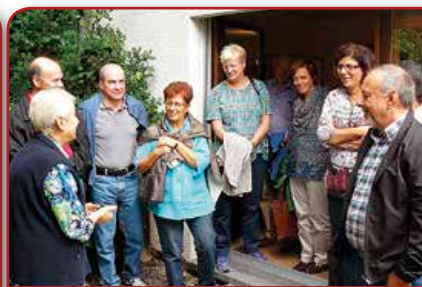
In visita ai «luoghi» di Chiara nel Vallese

afternoon of recreation, rewarded with a warm applause, even if their performance was maybe not as artistic.