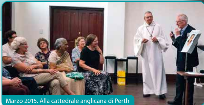
Marzo 2015. Alla cattedrale anglicana di Perth