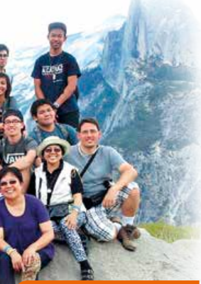
Sierra Nevada (California)