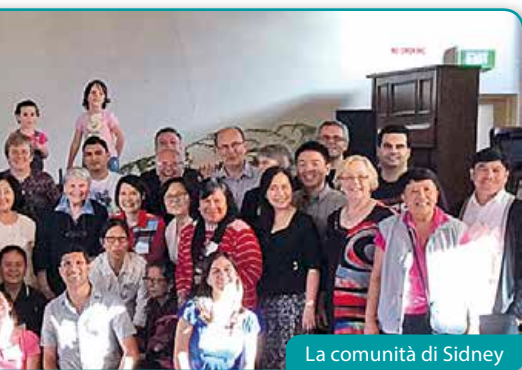
La comunità di Sidney