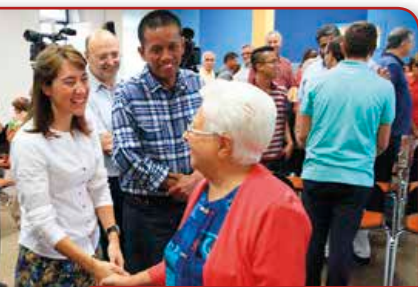
Dopo il tema di Emmaus sull'unità