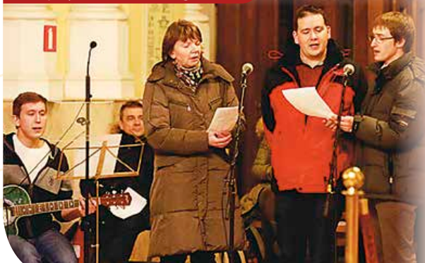
Moscow, february 11, 2016. The prayer for the meeting of Cuba