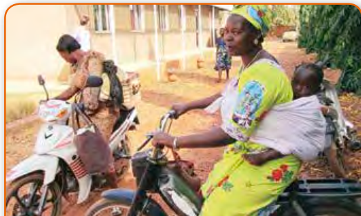
Burkina Faso, at the meeting with the community. Due to the distance and heavy climate, the most common means of transport are the bicycle and motorcycle.

We had the possibility of getting to know this Country which is the closest to to the Sahara Desert. Many survive with water from wells and not all of these water sources are potable everywhere. In spite of the scarcity of