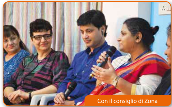
Con il consiglio di Zona

With the visit to Vasai , the diocese to the north of Mumbai, there were 600 persons, among whom were priests, religious and lay people, gathered together to celebrate the end of the Year dedicated to consecrated life. There,