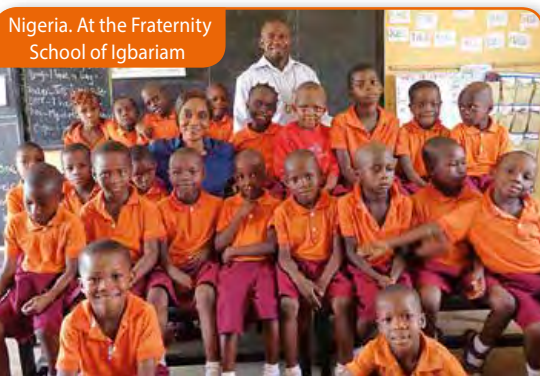
Nigeria. At the Fraternity School of Igbariam

Determination and faith in the love of God together with the joy of belonging to the Work of Mary, these were the gifts we received in Nigeria both at Onitsha and at Abuja.