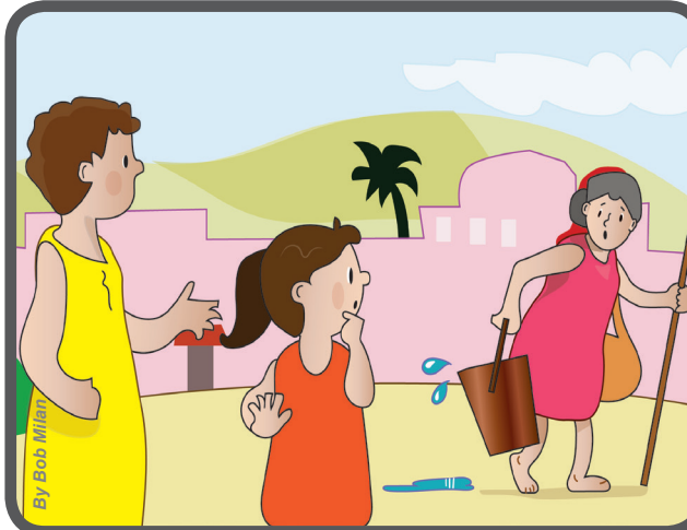
They tried to do it, especially when they saw that someone needed help.