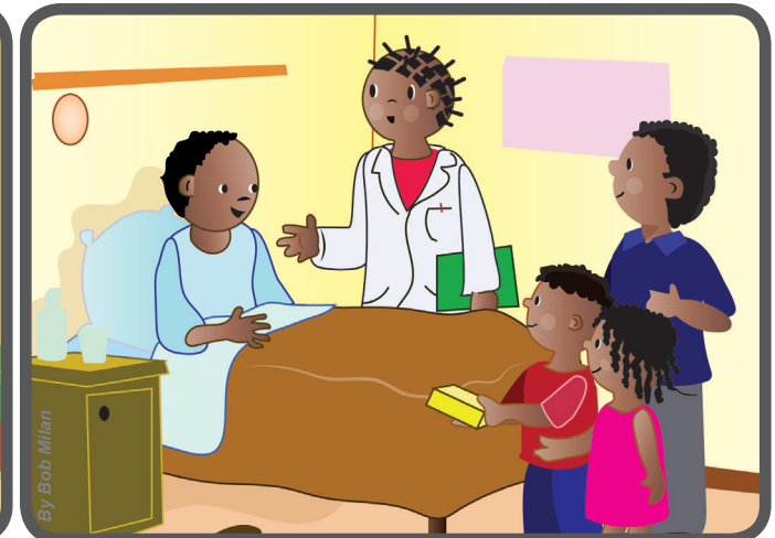
Then they bought the soap and took it to the hospital.