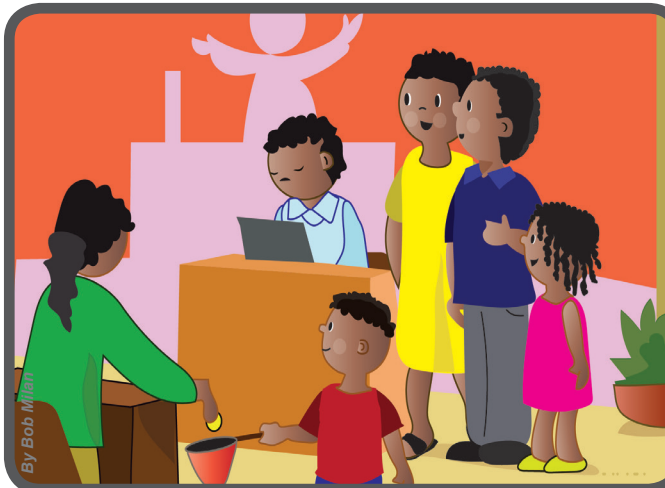
And so one Sunday, together with the adults, they sang for the Mass and asked for donations to help these sick people.