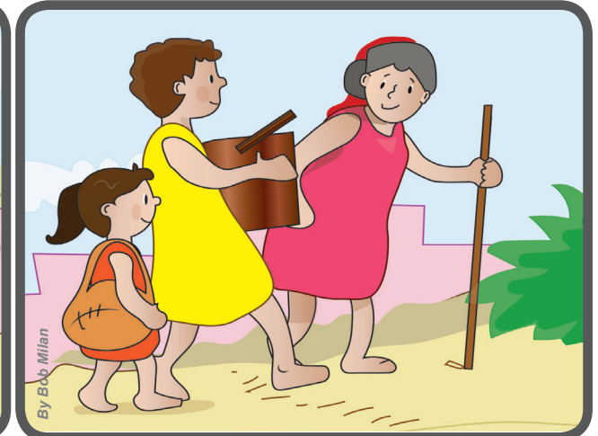
They stay close to them and support them with love and patience.