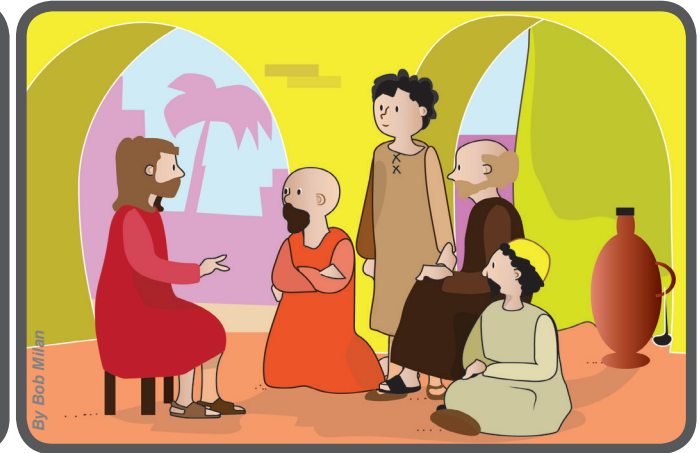
Then Jesus called his disciples aside and gave them the power to cure illnesses. He told them, “You received without payment; give without payment” (Mt 10:8).