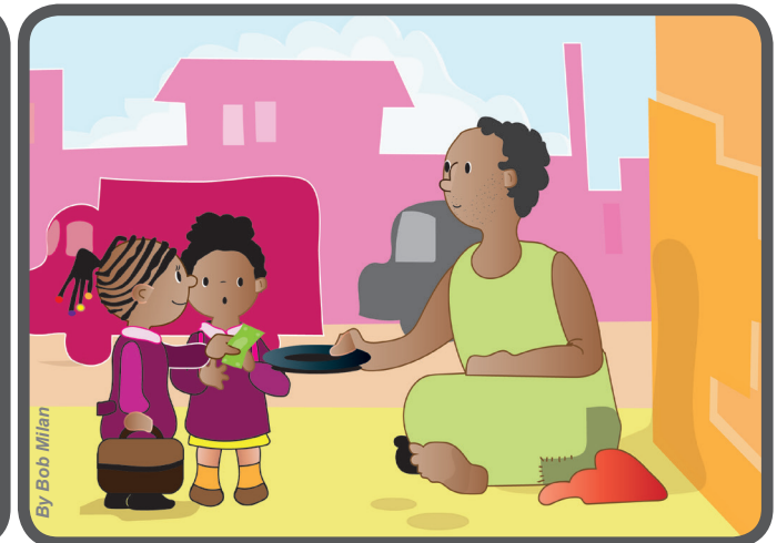
But I told myself that tomorrow I would find something to eat, but would he? So I gave him the money I had for the sandwich and I felt my heart fill up with joy.”