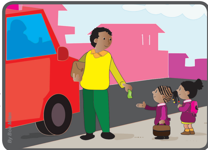
On the way to school, I was really very hungry. Then I met my uncle who gave me money to buy a sandwich.