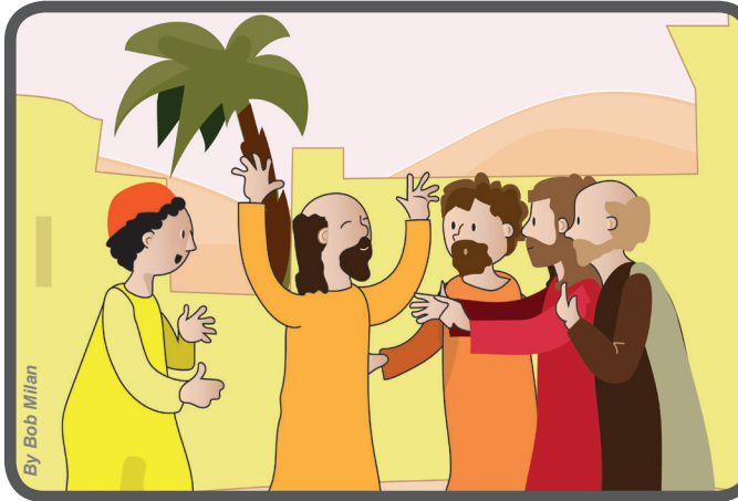
Jesus healed him and the people said, “We’ve never seen anything like this!” (Mt 9:32-33).