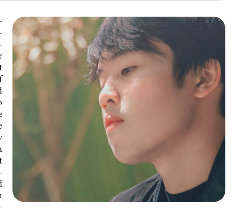
(see Il Vangelo del Giorno, Città Nuova, anno VI, n.4, July-August 2020)