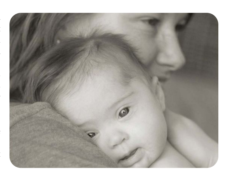
(see Il Vangelo del Giorno, Città Nuova, anno VI, n.4, July–August 2020)