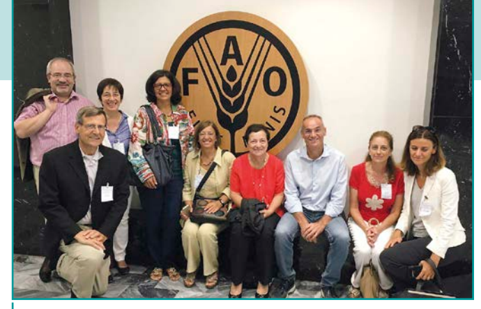
Rome, 8 september 2017. The Focolare Movement's delegation at the Fao

enthusiasm. The Youth for a United World too took up the challenge inserting it as one of theri priorities in building a united world.