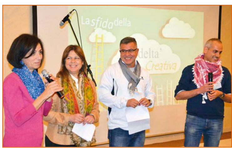
In Amman in Jordan they were 135 coming from various Countries in the Middle East.

Thanks to this small common format, there was a myriad of simple yet extraordinary stories shared in the various retreats