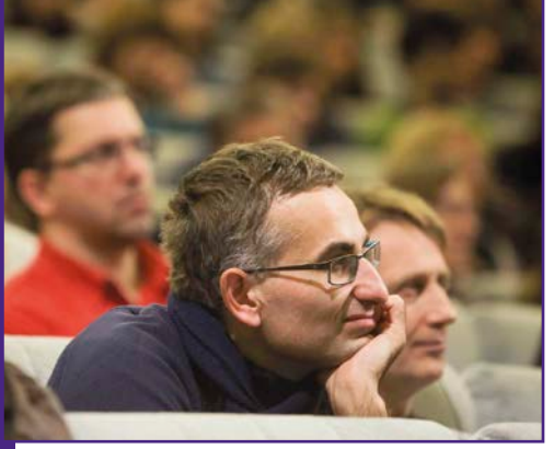
So it is not surprising that the project to form

challenge to erase those invisible barriers that inevitably exists among the various peoples, that are rooted in historical wounds and prejudices. The unity among these countries was just an ideological label.