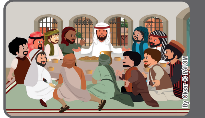
During the Last Supper, Jesus was at the table with his disciples. He had just washed their feet.