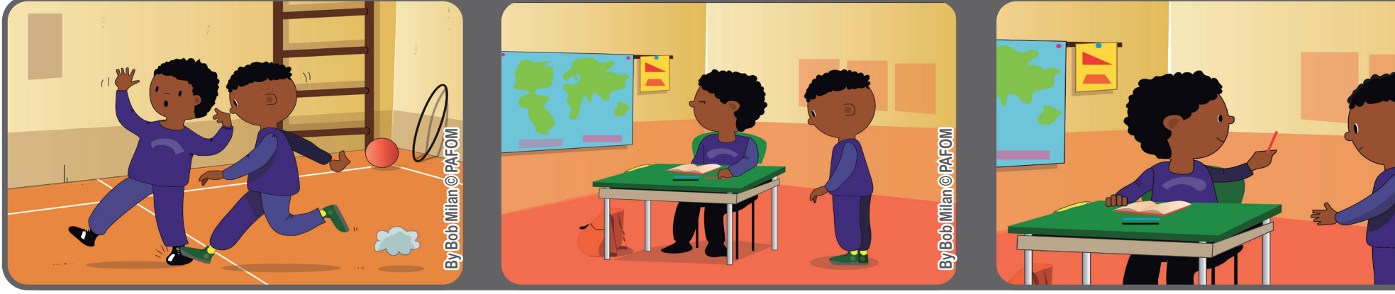
One day in the gym one of my classmates hurt my foot and I got very mad at him.

God always forgives everyone and so we should do the same.