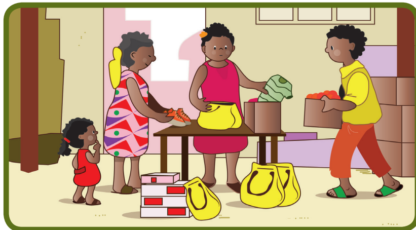
When we give, we are happy: To help the refugees coming into our country, the community of Abuja collected clothes, medicine, food and money. One Gen 4 was there when they filled the bags and saw that someone had given shoes for little children.