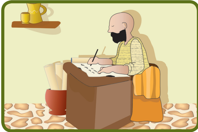
The apostle Paul wrote to the Christians who lived in Philippi and told them to be always full of joy.

“Rejoice in the Lord always!” (Phil 4:4)