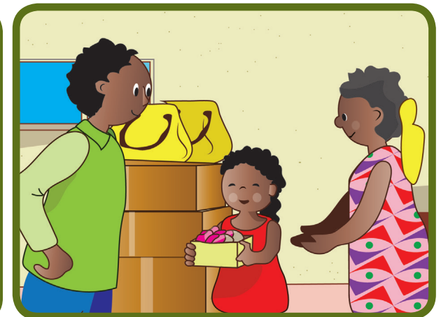
She ran back home and got the shoes she liked the most. She was very happy and told the others it was because she was giving her shoes to Jesus.