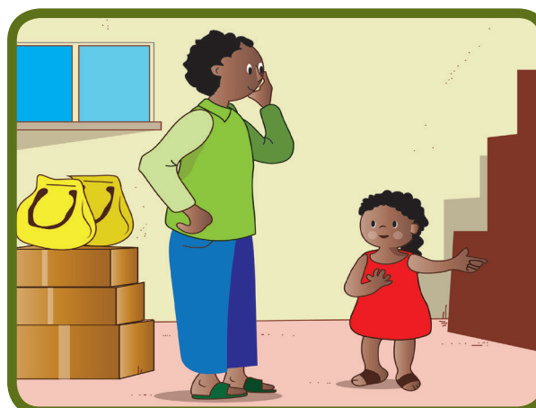
She went to her Dad and told him, “I want to give a pair of shoes, too!”