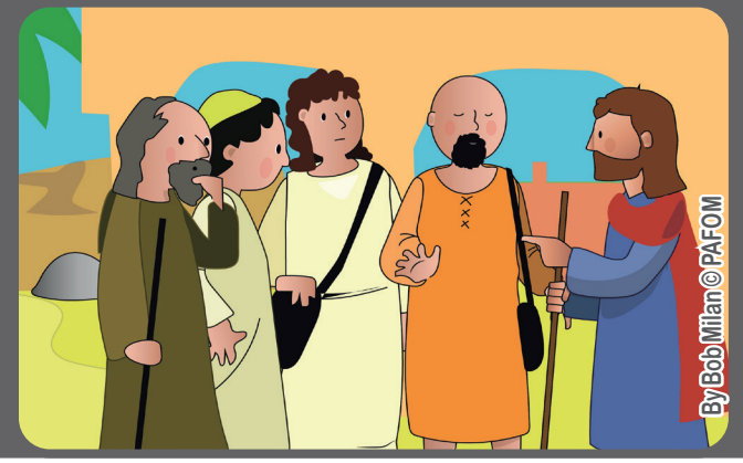
When they got there, Jesus asked them: "What were you talking about?" They were ashamed and didn't answer. In fact, they had been discussing which of them was the greatest and the best.