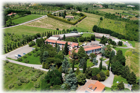
The first began at Loppiano in Italy in 1964.

Following on from that experience the idea of having a permanent Mariapolis developed. There are now twenty Focolare 'cittadelle' or small towns, at different stages of development, throughout the world.