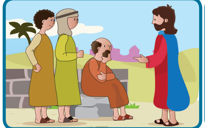
Jesus taught his followers that God's justice is his immense love for every person on earth.

"Justice, and only justice, shall you pursue" (Dt 16:20).h