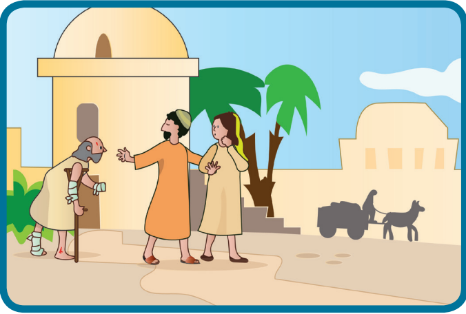
But even in the time of Jesus people suffered great injustices, like poverty or the lack of freedom.