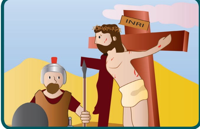
Jesus forgave his enemies, even when they crucified him.