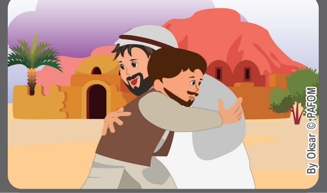
Peter wanted to tell Jesus that he was ready to forgive even seven times in a row!